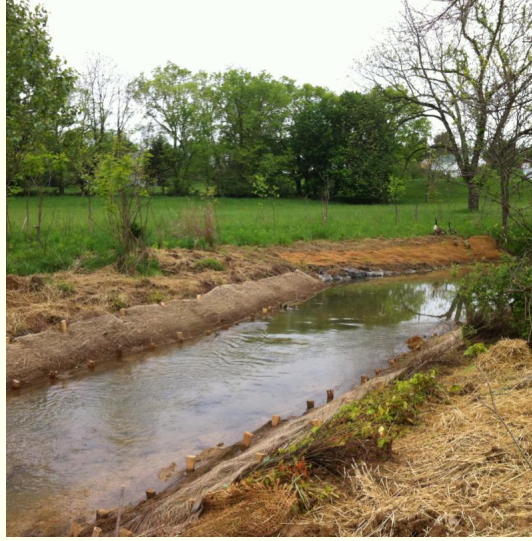
Brush mattresses sprouting on banks of Tuscarora Creek

Also, scholarship funds are still available for the Forum. Scholarships are given with priority to new applicants, applicants from diverse communities, applicants who work for diverse organizations and students. Those who have already registered and paid for the Forum may still apply. Applications are due by