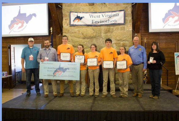
Mineral County FFA - 2nd place team

An impressive five teams from Chesapeake Bay Program counties finished among the top six during the 2018 West Virginia Envirothon at WVU Jackson's Mill in Lewis County.