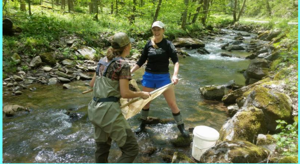
SOS monitoring volunteers sample riffles for benthic macroinvertebrates_ which can act as living indicators of stream

While crossing over Allegheny Mountain at the Randolph-Pendleton County border, as he has many times over the years, White recognizes the significance of the Eastern